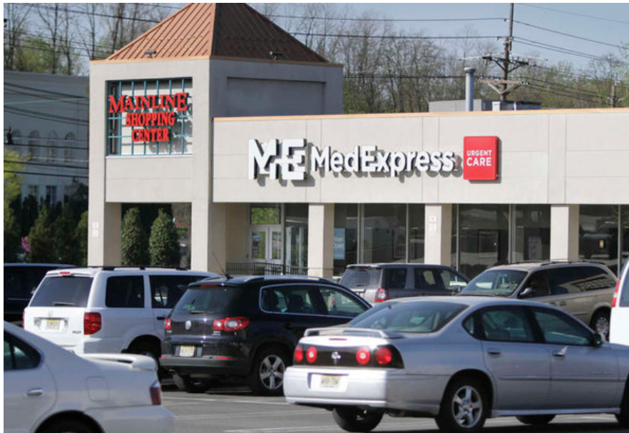
MedExpress Urgent Care in Cinnaminson is one of the area's newer for-profit urgent-care sites.